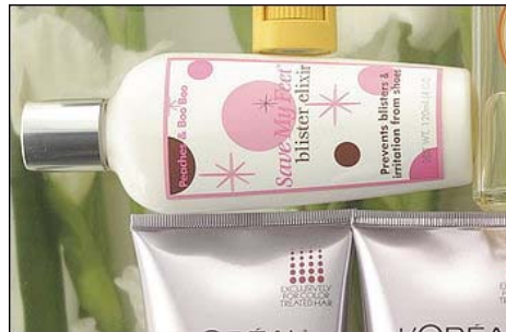
Peaches & Boo Boo Save My Feet lotion ($20 at www.peachesandbooboo.com ).